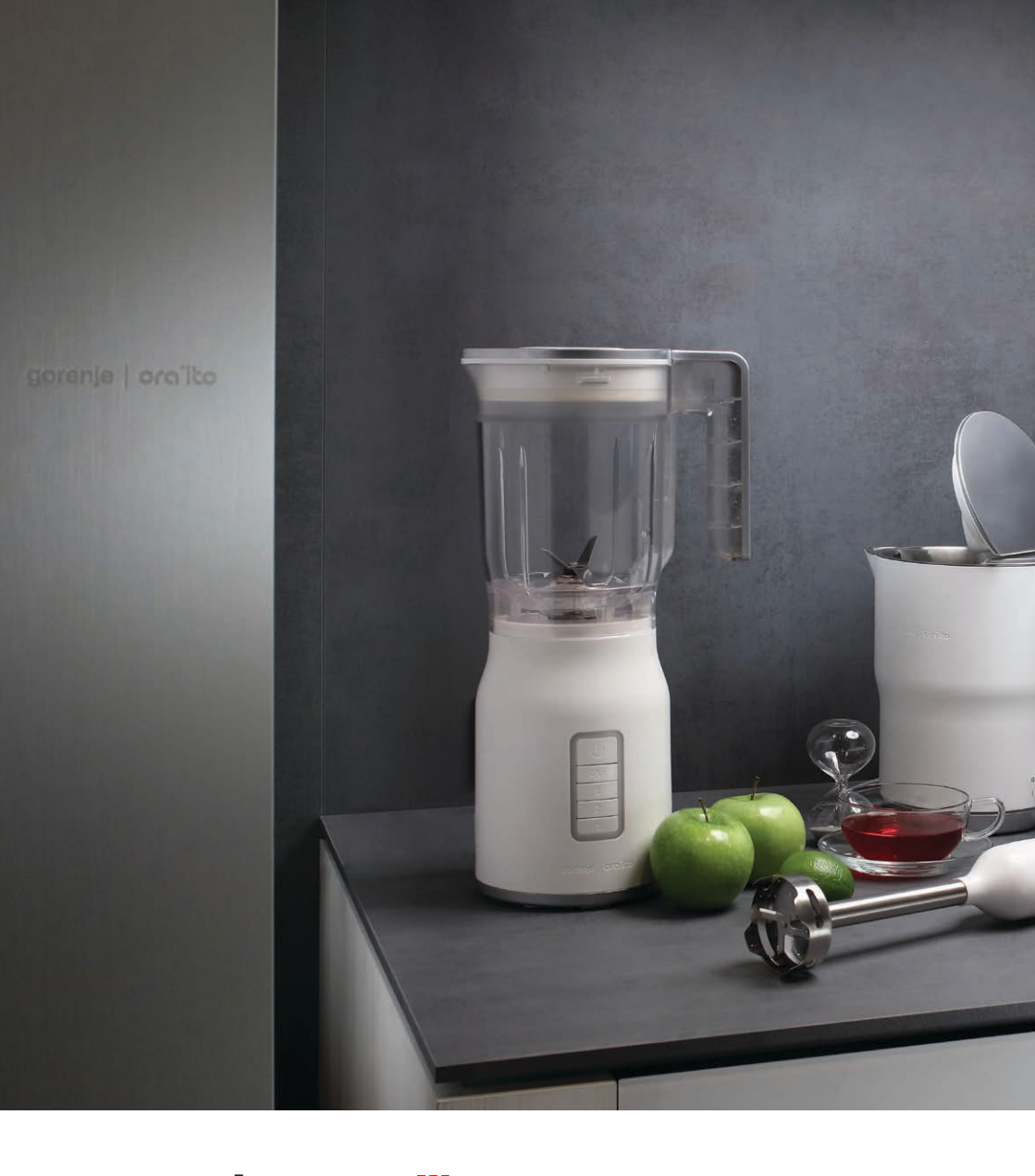
gorenje By ora ito